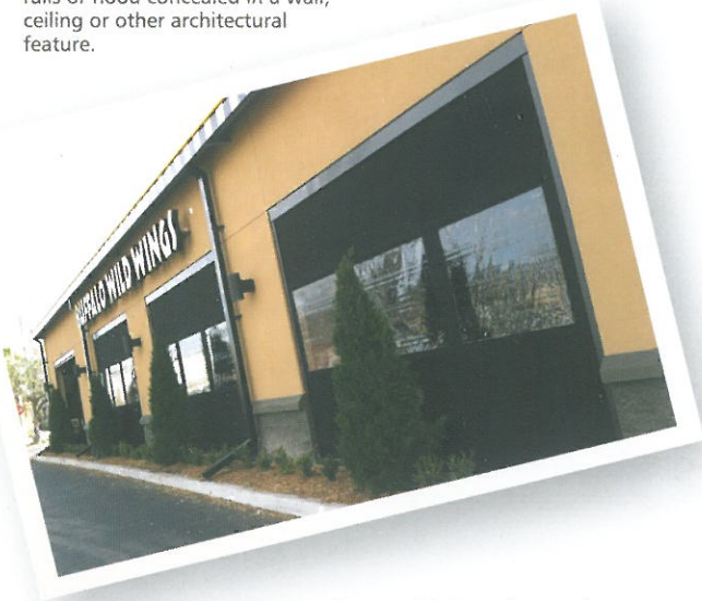
Suntex 80 Premium Solar