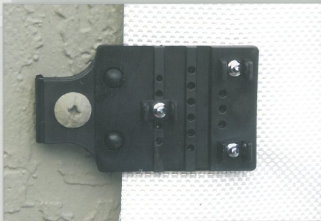
Nylon one-piece clips securely retain fabric with only 3 #14 x 3/4" sheet metal screws