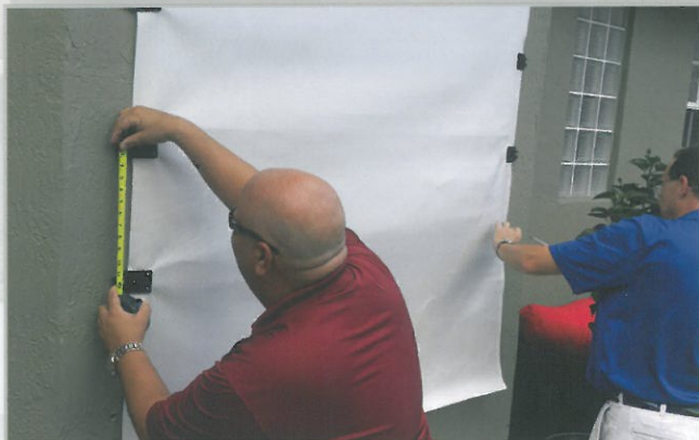
Quick and easy installation of the hurricane fabric with nylon hurricane clips

How many times have you protected your home by installing pieces of plywood over your doors & windows? Have you ever tried doing it alone . . . especially in an emergency? Not easy, is it?